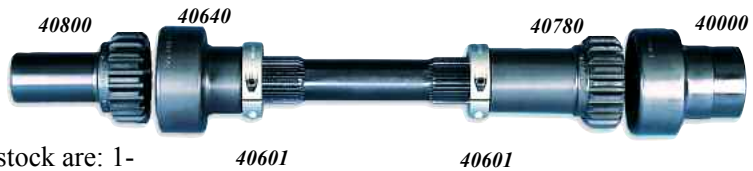
Typical Powerglide to 9" Ford set-up with 32 spline shaft

MW solid driveshafts are for in vehicles with solid mounted rear ends where a single coupler is not long enough. These shafts are available in stocked lengths from 6" to 28" long. All shafts are machined out of 4340-alloy steel. All shafts are, micro polished, and heat-treated with MW's austempering process. All shafts receive a black oxide finish. Standard shafts in stock are: 1-3/8-16 straight key, 1-3/8-32 involute spline and 1-1/2-35 involute splines. Shafts over 12" have 4 full inches of spline on each end and can be shortened up to 2" on each end. Couplers and spline shafts should not be used unless perfect alignment is assured. Critical speed calculations must be considered for these shafts. Call with your numbers to confirm the RPM critical speed value. MW can also build custom solid driveshafts to your specs with different splines upon request.