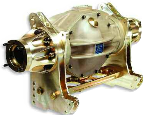
96012 Pro 4-Link 12 Bolt Housing